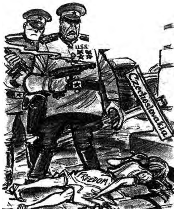
A cartoon published in the USA in September 1968. The soldier is saying 'She might have invaded Russia'.