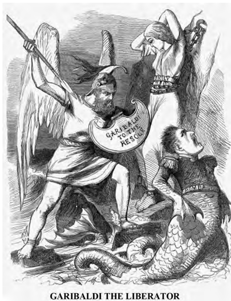
A British cartoon published on 16 June 1860. The sea monster represents the Bourbon monarchy.